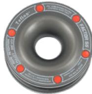
Factor 55 ® Rope Retention Pulley XTV