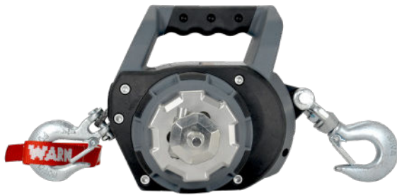
Warn ® Drill Winch with Lineman Adapter Kit

LDW-BAG: Camo Bag with Handles, #6 Grommet for Bucket Hook and Drain Hole