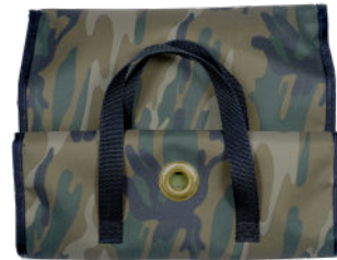
Camo Bag with Handles