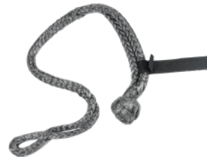
Factor 55 ® Standard Duty Soft Shackle