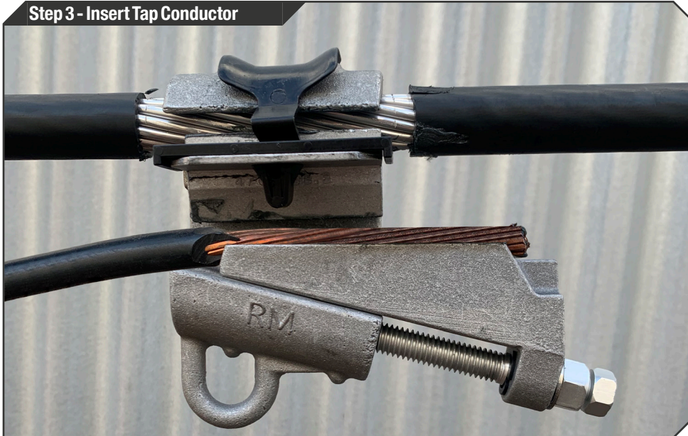
Step 3 - Insert Tap Conductor