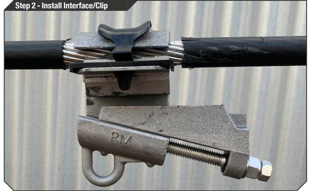
Step 2 - Install Interface/Clip