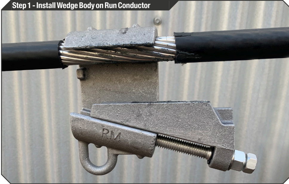
Step 1 - Install Wedge Body on Run Conductor